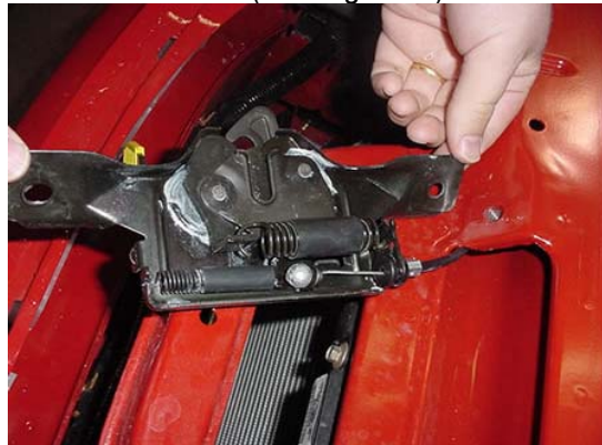
Figure4 (Bonnet Latch)

Refer to WSM: 501-14-5 to remove the Bonnet Latch. (See Figure. 4)