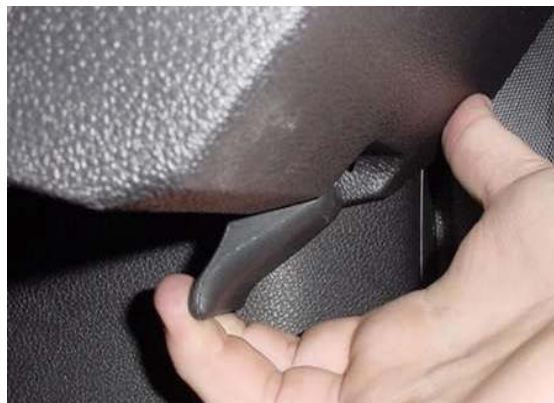
Figure 3 (Release handle in desired "release" position)