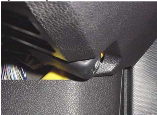
Figure 1 (Release handle in home position)

Refer to Figure 1 to Figure 3 for an illustration of the concern.