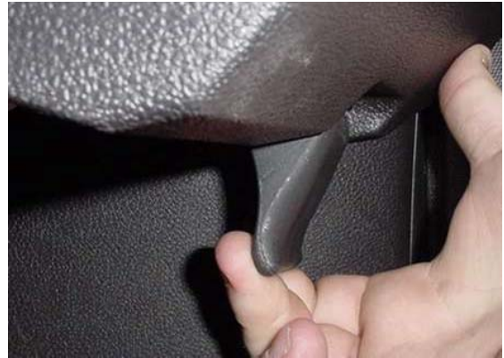
Figure 2 (Release handle at maximum travel)